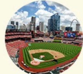
G. Bush Stadium, 15 Min Walk