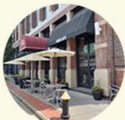
B. Kimchi Guys