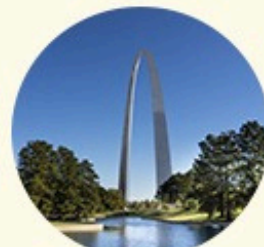
H. Gateway Arch Park, 5 Min Walk