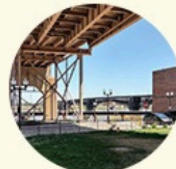
D. Dog Park, 3 Min Walk