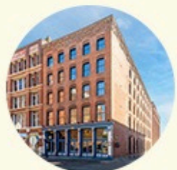
A. Hoffman Building