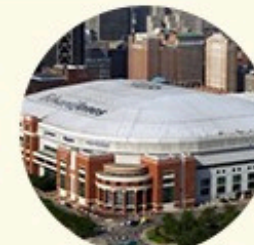
E. The Dome, 7 Min Drive