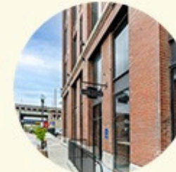
F. The Cobblestone STL