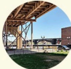
D. Dog Park, 3 Min Walk