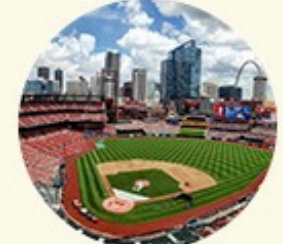
G. Bush Stadium, 15 Min Walk