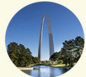
H. Gateway Arch Park, 5 Min Walk