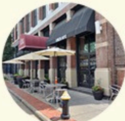
B. Kimchi Guys