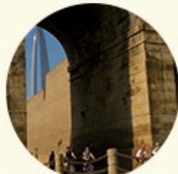
C. Mississippi Greenway