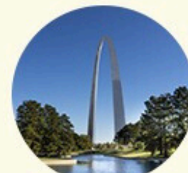
H. Gateway Arch Park, 5 Min Walk