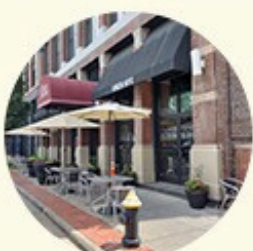
B. Kimchi Guys