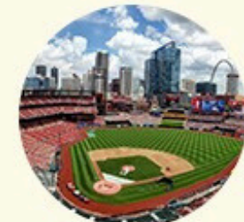
G. Bush Stadium, 15 Min Walk