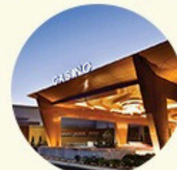
I. Horseshoe Casino, 5 Min Walk