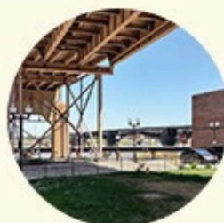
D. Dog Park, 3 Min Walk