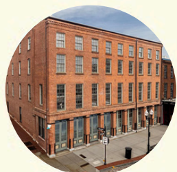
A. Trader Building