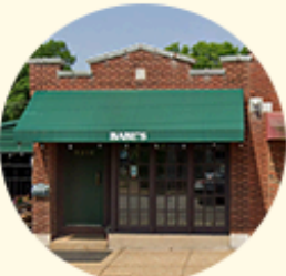
H. Babe's Tavern