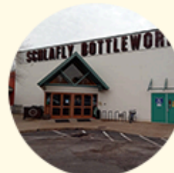
E. Schlafly Bottleworks