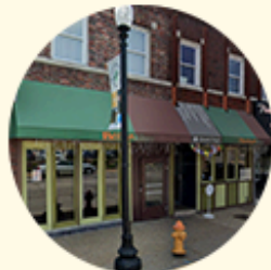
C. Boogaloo Restaurant