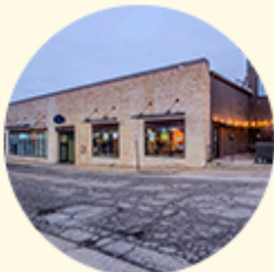
B. The Blue Duck