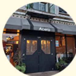
D. Acero Ristorante