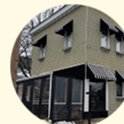
F. The Piccadilly