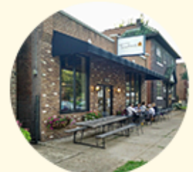
G. Farmhaus Restaurant