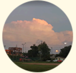
J. Francis R. Slay Park