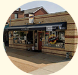
I. Vinnie's Italian Beef