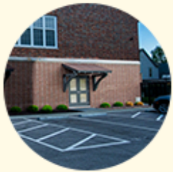
A. Wilkinson Building