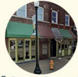
C. Boogaloo Restaurant