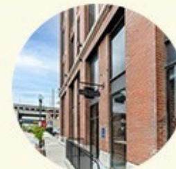
F. The Cobblestone STL