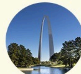
H. Gateway Arch Park, 5 Min Walk