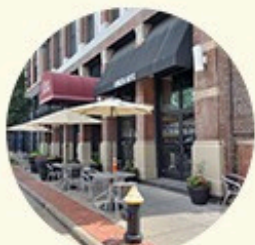
B. Kimchi Guys