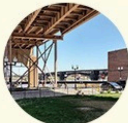
D. Dog Park, 3 Min Walk