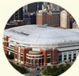
E. The Dome, 7 Min Drive