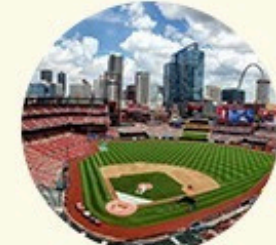
G. Bush Stadium, 15 Min Walk