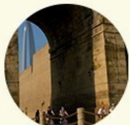
C. Mississippi Greenway