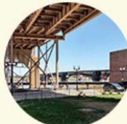
D. Dog Park, 3 Min Walk