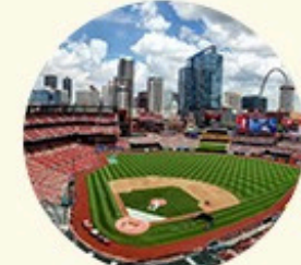
G. Bush Stadium, 15 Min Walk