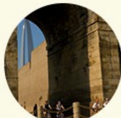
C. Mississippi Greenway