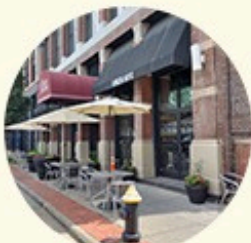
B. Kimchi Guys