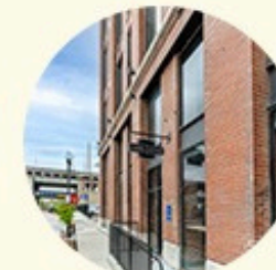
F. The Cobblestone STL