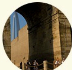
C. Mississippi Greenway