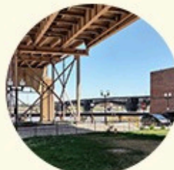
D. Dog Park, 3 Min Walk