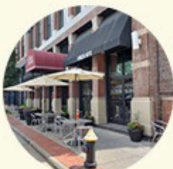
B. Kimchi Guys