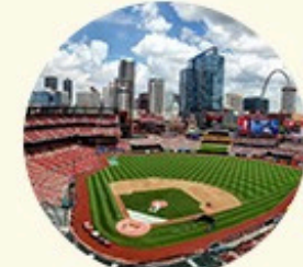
G. Bush Stadium, 15 Min Walk