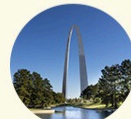
H. Gateway Arch Park, 5 Min Walk