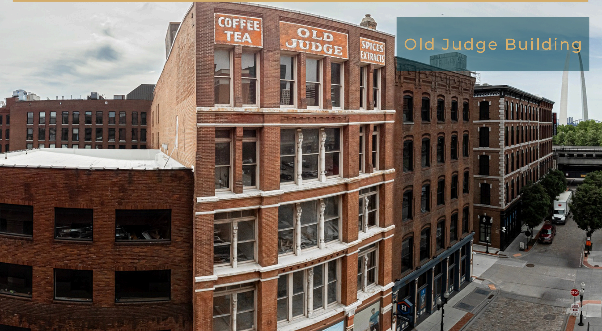
Old Judge Building