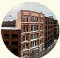
A. Old Judge Building