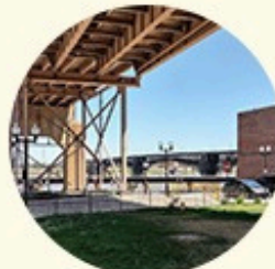
D. Dog Park, 3 Min Walk