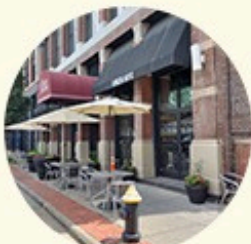
B. Kimchi Guys