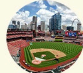
G. Bush Stadium, 15 Min Walk