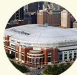
E. The Dome, 7 Min Drive