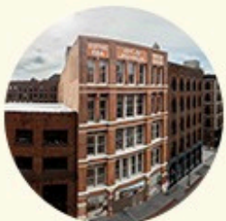
A. Old Judge Building