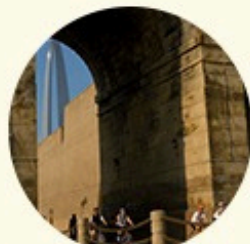
C. Mississippi Greenway