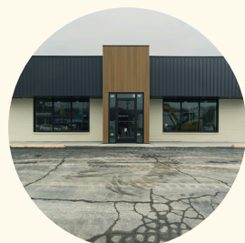
A. 7940 Watson Rd