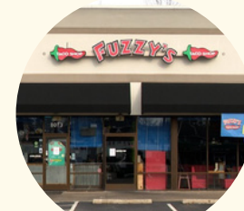
J. Fuzzy's Tacos