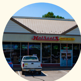
D. Hot Shots