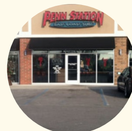
G. Penn Station Subs