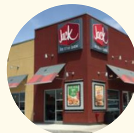
F. Jack in the Box