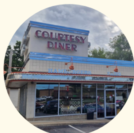
C. Courtesy Diner